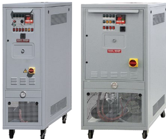
TT-388 / 48 kW